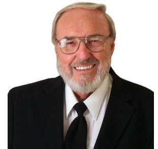
Yisrayl Hawkins THE HOUSE OF YAHWEH

14 We know that we have passed from death